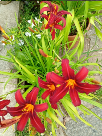
H. Stafford, scarlet star like flowers with green throat

and the tall double flowered H. Kwanzo Flore Pleno.