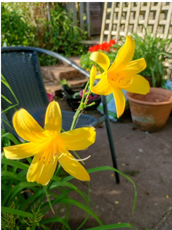
H. lilioasphodelis, small flowers, clear yellow, highly scented.

Forming large clumps of strap - like leaves the colours range from white to deepest red. The older varieties have simple star - like flowers but the modern hybrids tend to have large ruffled flowers usually with a contrasting coloured throat. The individual flowers last one day but on an established plant a succession of flowers can be produced daily for a month! Some of my favourites are: