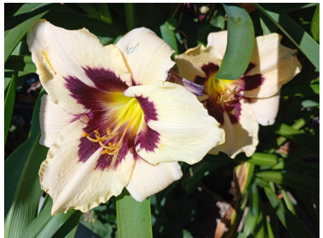
H. Pandora's Box, pale cream with green and burgundy throat colouring.